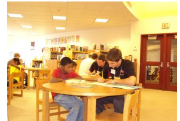
An EVERYBODY WINS! volunteer and student at lunch