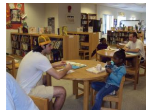
EVERYBODY WINS! Power Lunch aims to cultivate a love of reading. A volunteer meets with an elementary school student during lunch.