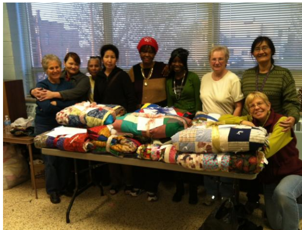
Sewing and English students and tutors with quilts to be donated for the holidays.

Non-profit Org. US POSTAGE PAID Permit No. 941 Albany, NY 12288