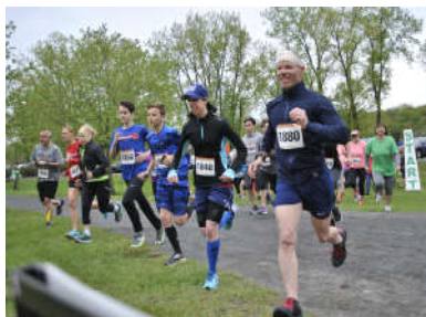
Literacy 5K Run/Walk at Schodack Island State Park