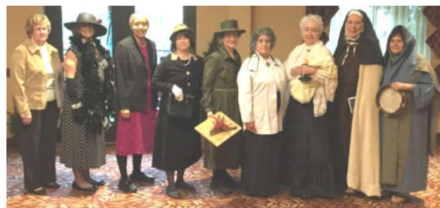
Famous Ladies' Tea at Hilton Garden Inn, Troy