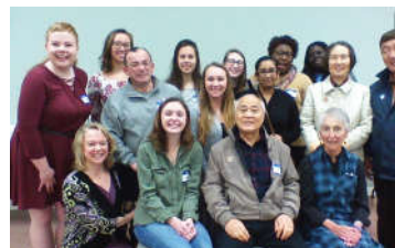
Conversation Partners and Learners

9 Conversation Partners from Sage College helped English language learners to strengthen their speaking and comprehension skills.