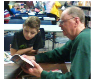
Everybody WINS! Power Lunch

114 volunteer mentors in the Everybody WINS! Power Lunch program helped 102 children develop a love of reading.