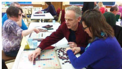
Team "We're All Dunn" at Scrabble Challenge