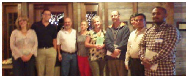
Blasch Employees and Readers at Authors' Night