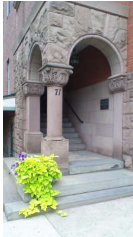
71 First Street, Troy