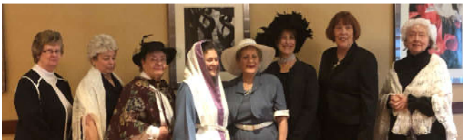
Famous Ladies' Tea at Hilton Garden Inn, Troy