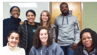
Volunteers from Sage College with learners from the EL Civics class

With the aid of 8 volunteers, 41 English language learners improved their English while learning about life in the United States in the English Literacy Civics program in Troy and Albany.