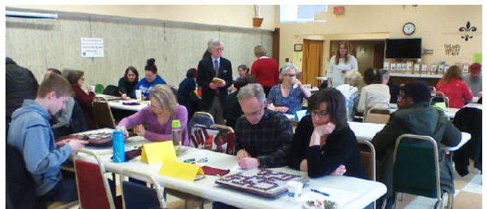
SCRABBLE Challenge at St. Michael's Church