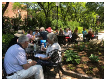
A Tutor Share and Exchange in the Garden at Russell Sage College, May 29, 2018